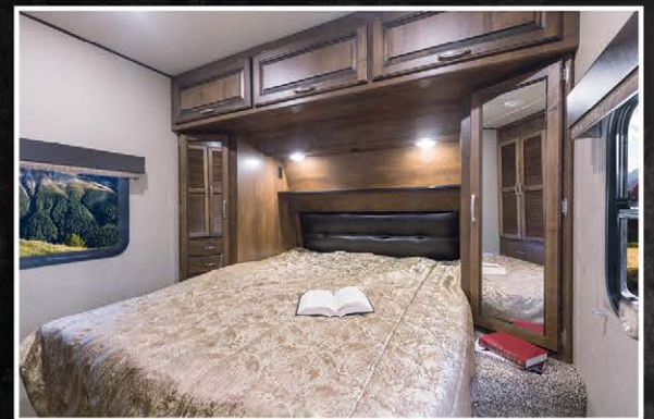
Residential Master Suite (297RSTS Shown)