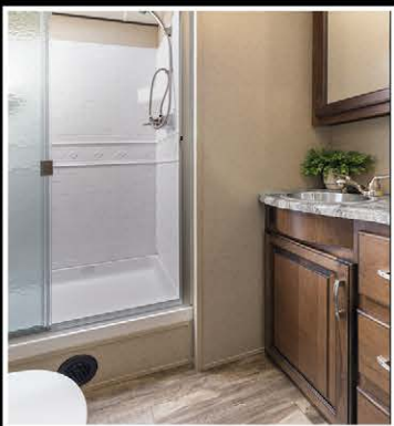
Spacious Master Bath (315RLTS Shown)