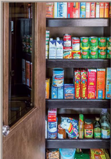
Class leading pantry storage