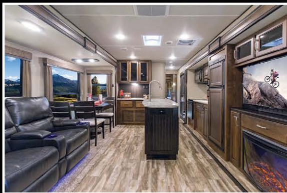
Spacious Living/Galley Area (297RSTS Shown)